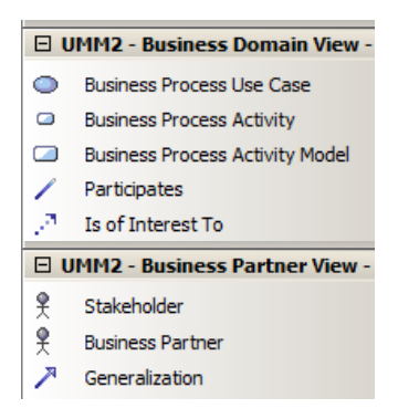
Figure 1: Screenshot of the UML profile